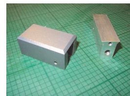
Slide on jaws

Sealing jaws: Flat, Crimp or custom designed. Standard size 25mm wide x 50mm long. Can be specified any width 5mm to 25mm.