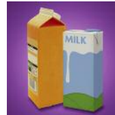
Printed carton board