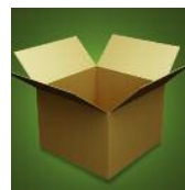
Unprinted carton board