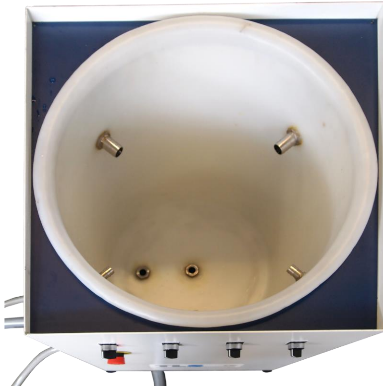
White water tank interior view

POWER SUPPLY: 110V/60Hz or 220V/50Hz single-phase