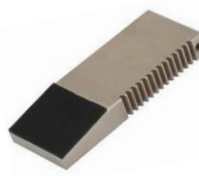
TH256-BG Rubber-coated jaws