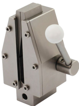
Item no.: TH256-10-T280 Special version for temperature range -70...+280°C

Jaws with other dimensions and surface coatings on request