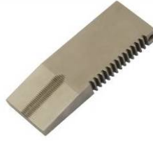
TH256-BV V jaws