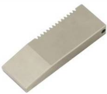
TH256-B Blank jaws