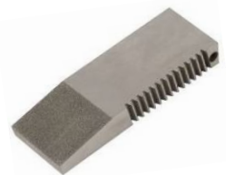
TH256-BD Diamond jaws