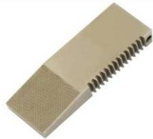
TH256-BP Pyramid (serrated) jaws