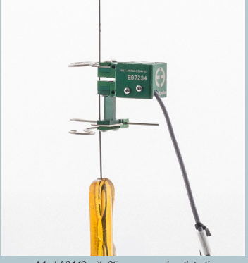
Model 3442 with 25 mm gauge length testing carbon fiber tow